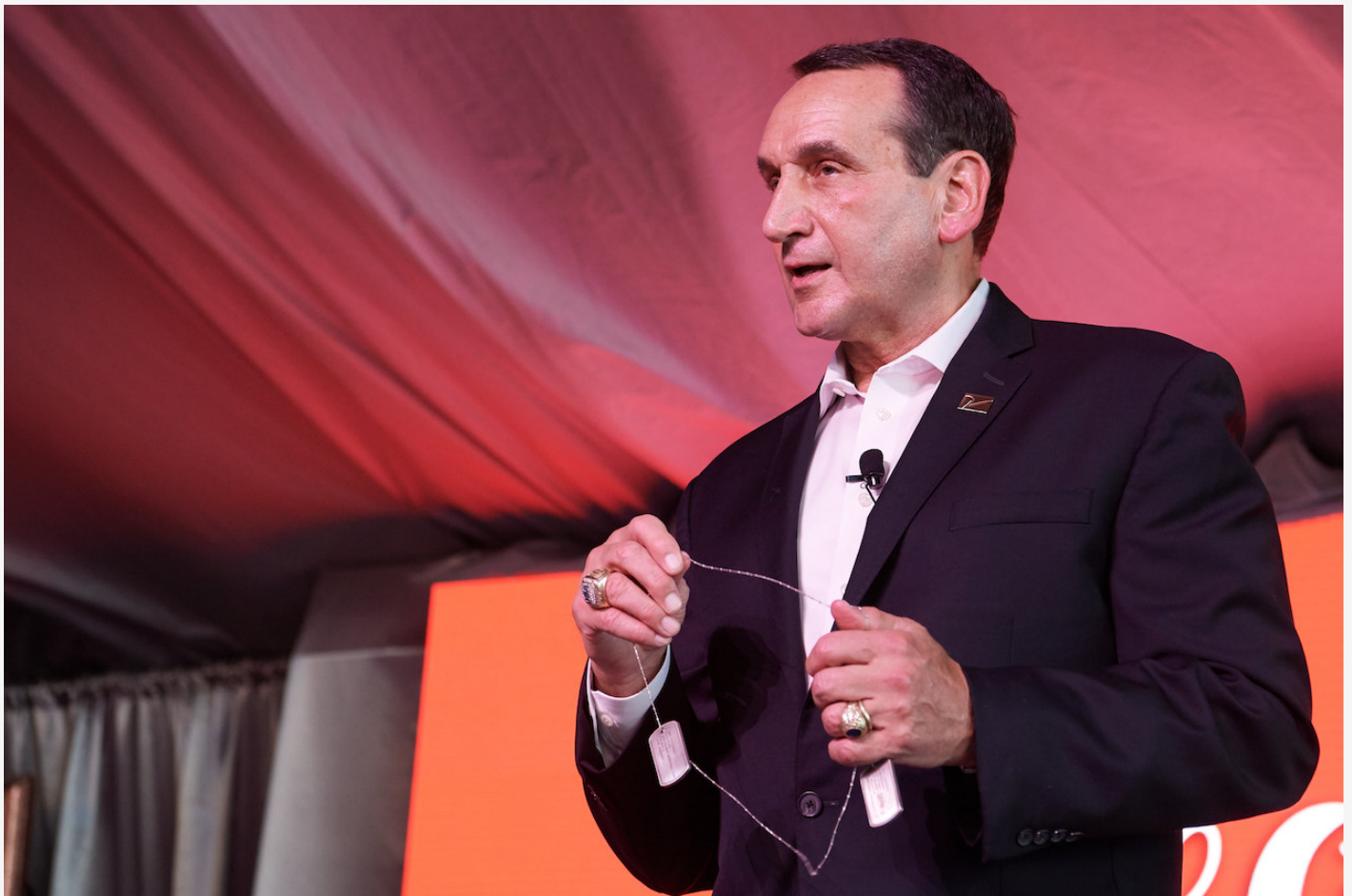
Mike "Coach K" Krzyzewski, Duke University's head men's basketball coach and V Foundation board member