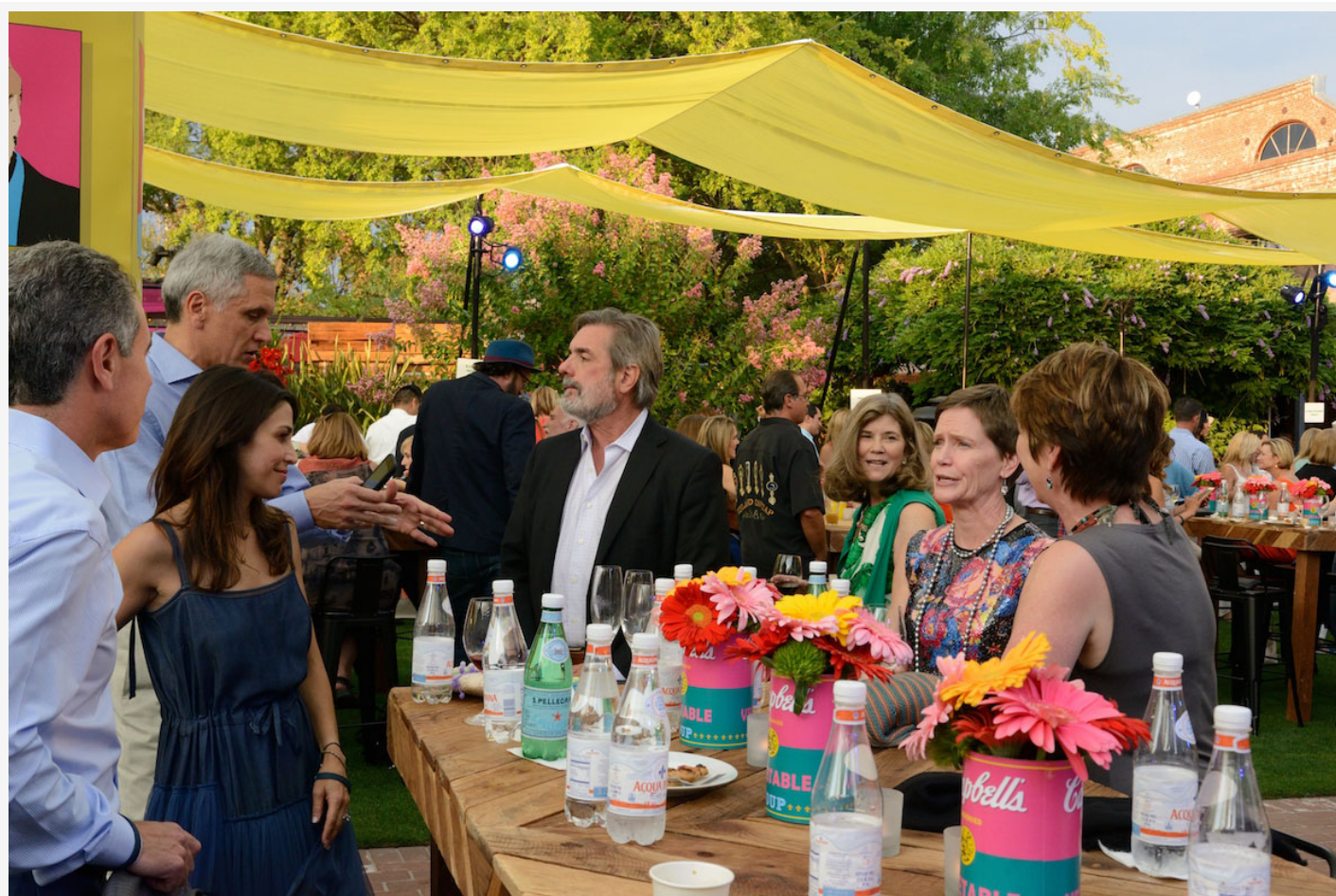
Atmosphere at Rock the V party

in-a-lifetime dinner. Guests dined, alongside the indoor pool, on a meal of butter-poached lobster, truffled squab breast, foie gras, and milk chocolate mousse. The menu was created by Chef Victor Scargle and the culinary team of Atelier Fine Catering .